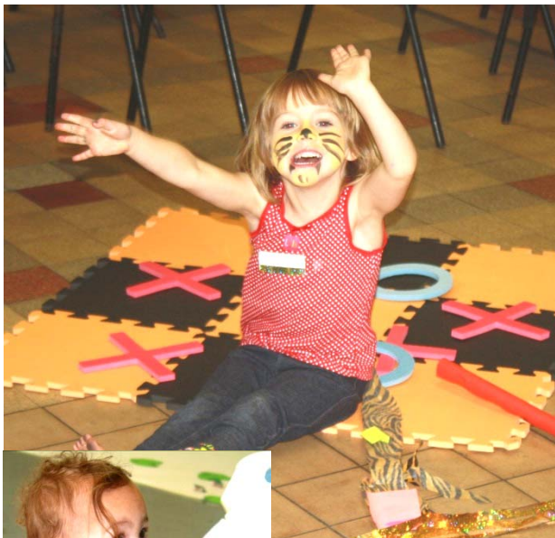
Children of all ages played games, did an art project, and had their faces painted