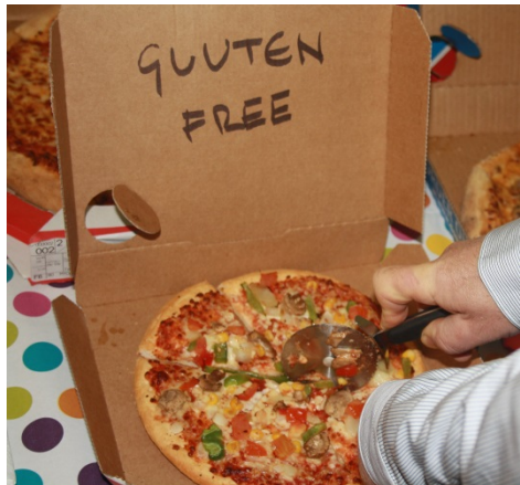
Special diets catered for